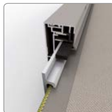
Detail of the side channel