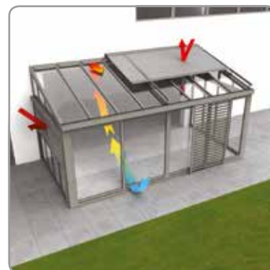
Healthy veranda concept®