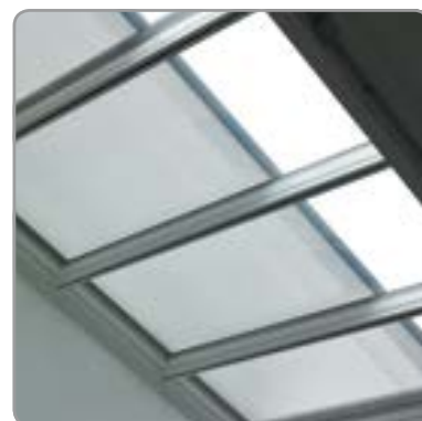
VELUX® Modular Skylights + Topfix® VMS