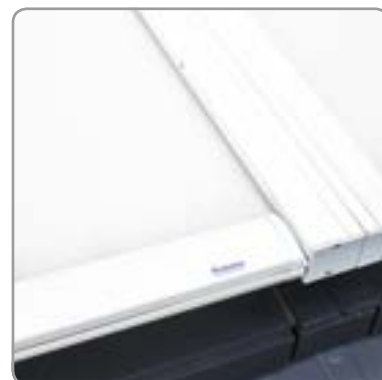
Detail bottom bar