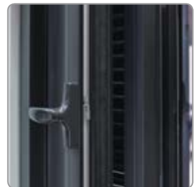
Detail of opened door with Nightcooling