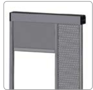
Exterior view of Fixvent® with Nightcooling