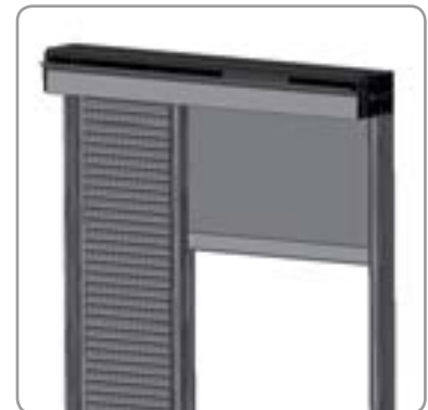
Interior view of Fixvent® with Nightcooling